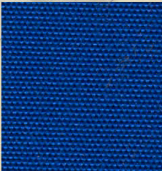
594 Pacific Blue*