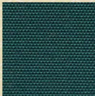
579 Forest Green