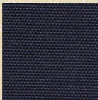
574 Commander Navy*