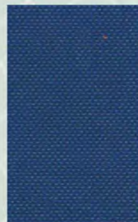
480 Royal Blue