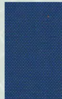
498 Harbor Blue