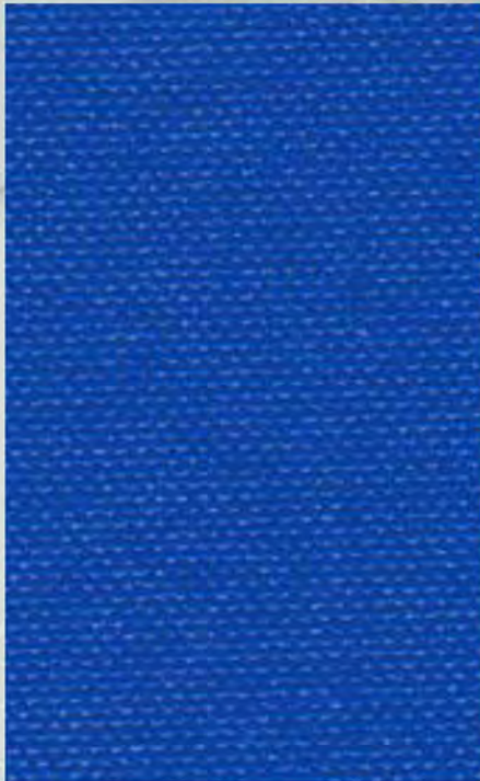
494 Caribbean Blue