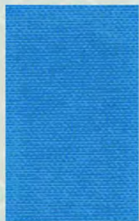
493 Lakeside Blue