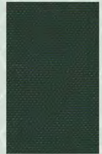
488 Forest Green