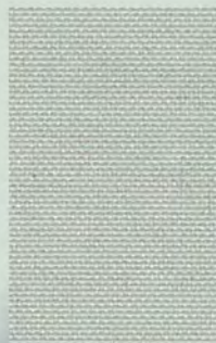
489 Silver Gray