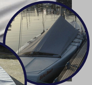
Over-boom, flat cover, trailing cover or undercover covers available

Dart Sails and Covers can offer an over-boom, flat cover, trailing cover or undercover for most one design dinghies and we custom manufacture for non-standard boats.