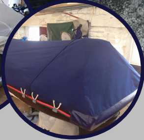
Custom manufactured for non-standard boats